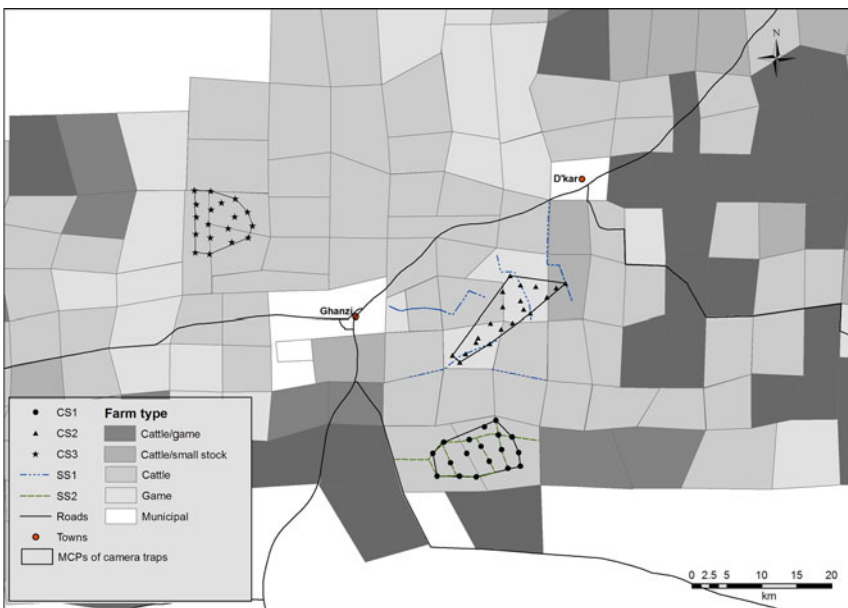
FIG. 2 The study area, (see Fig. 1 for location) showing locations of spoor (SS1, SS2) and camera-trap (CS1, CS2 and CS3) surveys.

previous 12 hours. A skilled Bushman tracker sat on the front of the vehicle and all fresh ( \leq 24 hours old) spoor of medium- and large-sized predators were recorded. Bushmen are renowned for the accuracy and reliability of their tracking skills (Stander et al., 1997) and have been used in several spoor survey counts in southern Africa (cf. Stander, 1998; Funston et al., 2001). When spoor was encountered it was examined and monitored to determine the distance the animal had travelled along the road and in what direction the animal then went. To reduce the risk of double counting, fresh hyaena spoor encountered within 1 km of a previous sample was assumed to belong to the same animal and was not counted.